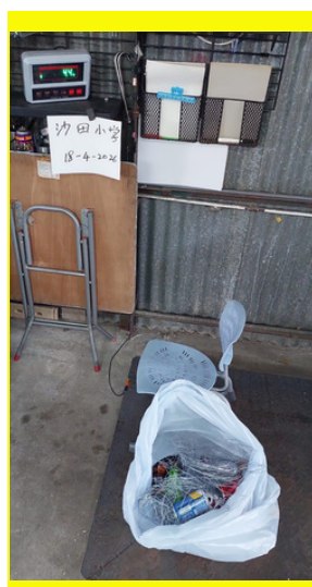
Metal 4.4 kg