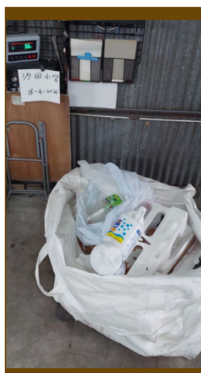
Plastic 5.6 kg