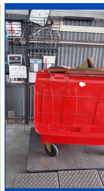
Paper & Cardboard 28.4 kg