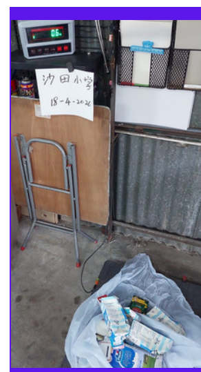
Tetra Pak 0.6 kg