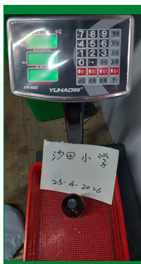
Glass 0.3 kg