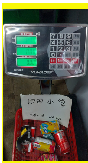
Metal 0.1 kg