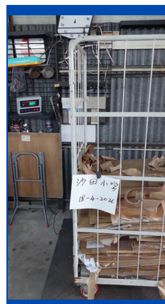
Paper & Cardboard 50.2 kg