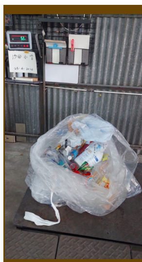
Plastic 5.2 kg