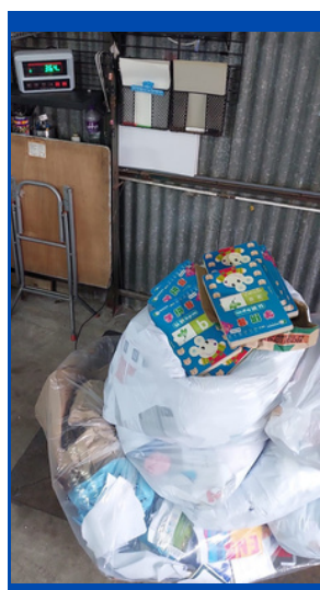
Paper & Cardboard 36.4 kg