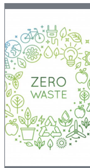
Discarded 0.0 kg