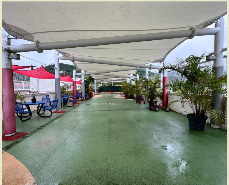
This is the roof top where you can relax and play.