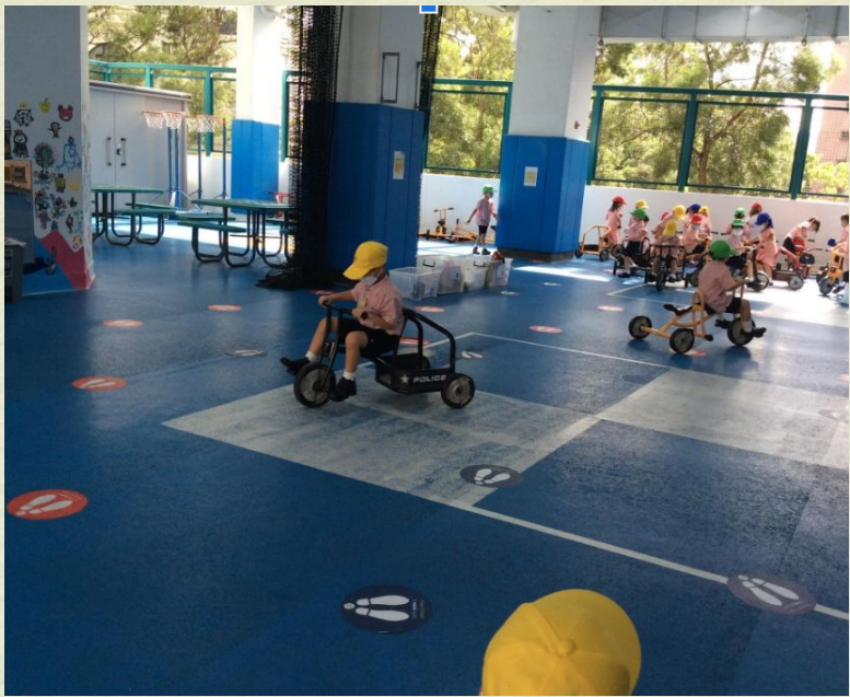
This is the undercover bike area.